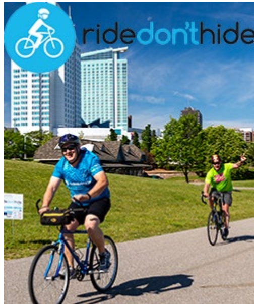
Ride Don't Hide June 26, 2022 Online & In-person Registration now open!