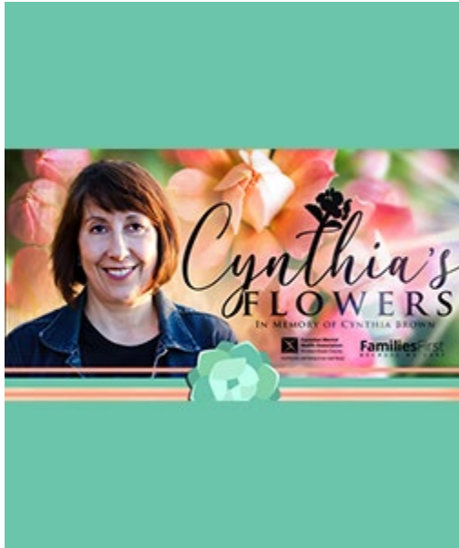
Cynthia's Flowers May 1-15, 2022 Complete details here