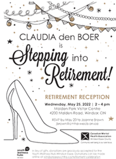
Stepping Into Retirement May 25, 2022 For details & to RSVP Malden Park Visitor Centre