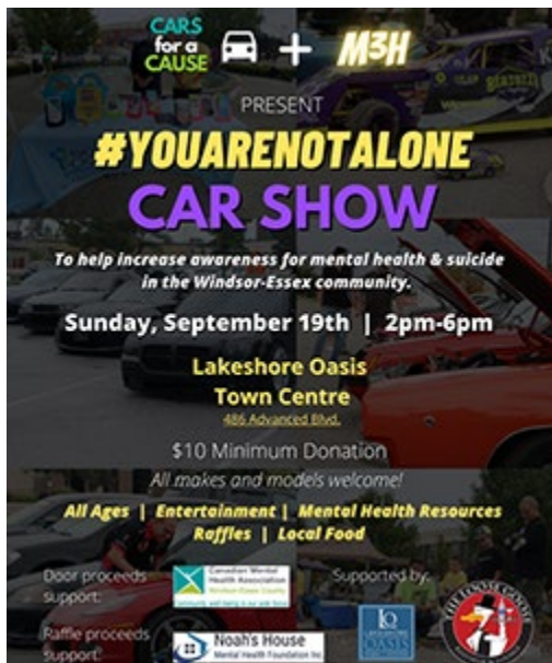
#YouAreNOTALone Car Show September 19, 2021 from 2pm-6pm Visit the Facebook page here Lakeshore Oasis Town Centre