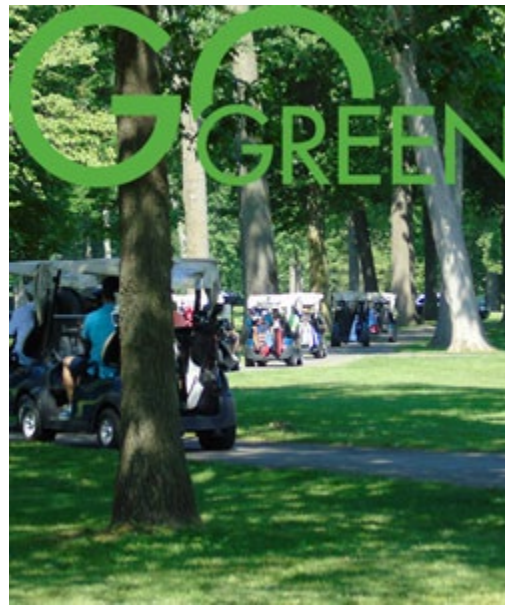
Go Green Golf Tournament Monday, September 20, 2021 SOLD OUT! Essex Golf & Country Club 7555 Matchette Rd.