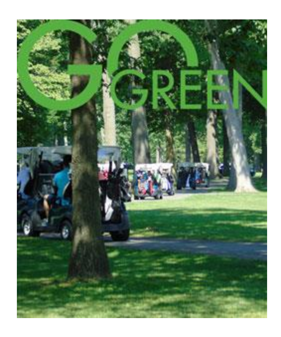
Go Green Golf Tournament Monday, June 8, 2020 SAVE THE DATE Essex Golf & Country Club 7555 Matchette Rd.