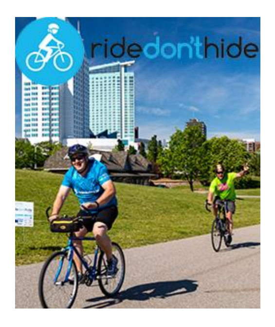
Ride Don't Hide Sunday, June 28, 2020 Registration Opens January 15 Children's Aid Society Parking Lot 1671 Riverside Dr. E.